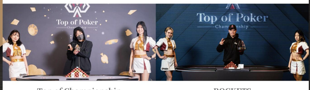
Top of Championship